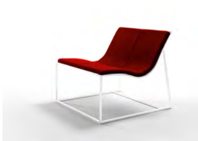
HOLY DAY armchair