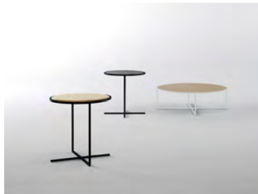
HOLY DAY table